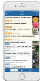
Recent Lists all Service Requests recently submitted.