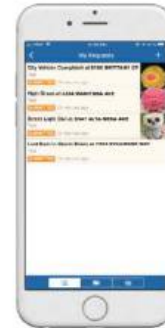
My Request Lists all your Service Requests.