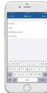
Reporter is your user information.