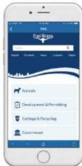
FAQ Quick access to City of Fort Worth website.