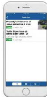
Favorites Lists all marked Service Request for easy monitoring.