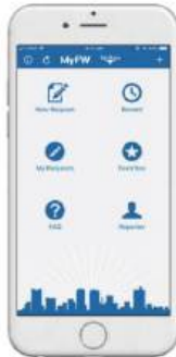
Main Selection Screen